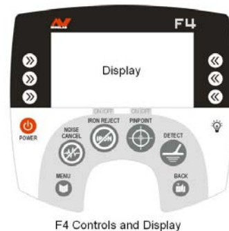
F4 Controls and Display

One approach to reduce FAR is to combine different sensors.