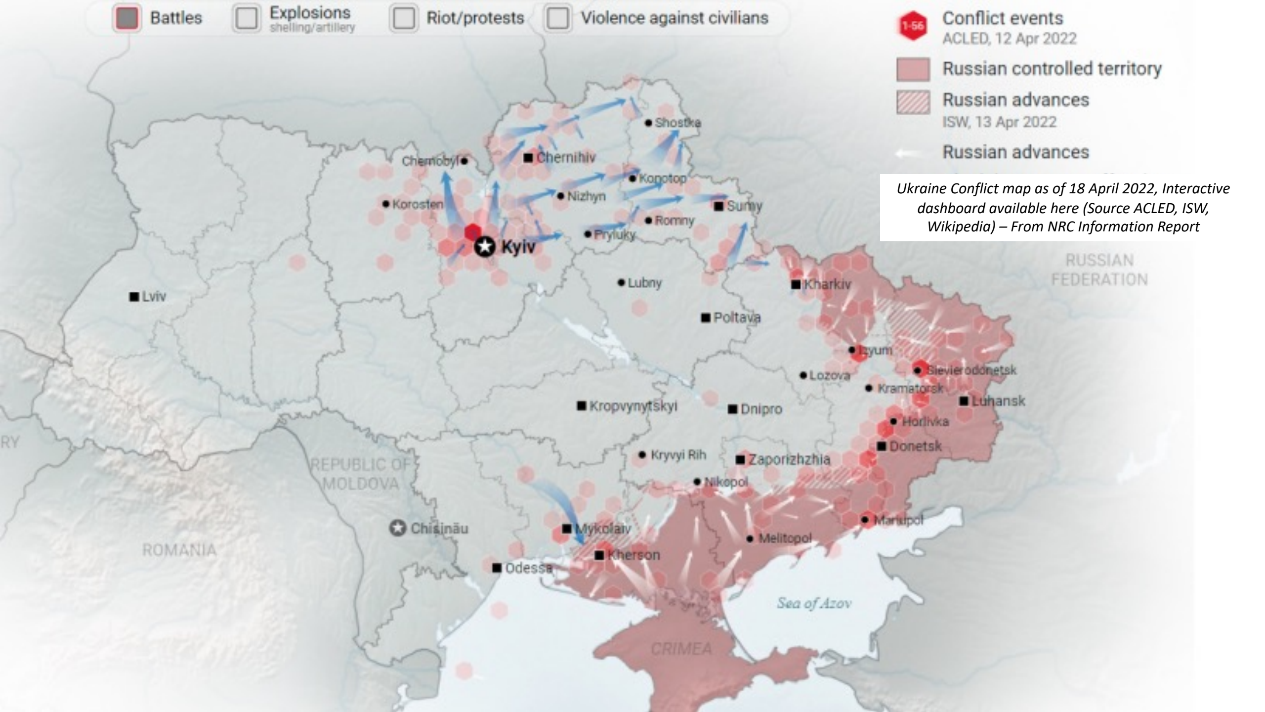
Ukraine Conflict map as of 18 April 2022, Interactive dashboard available here (Source ACLED, ISW, Wikipedia) – From NRC Information Report