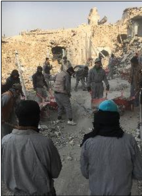
Cash workers cleaning an alley of the Old City