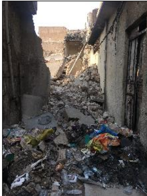
Before rubble removal