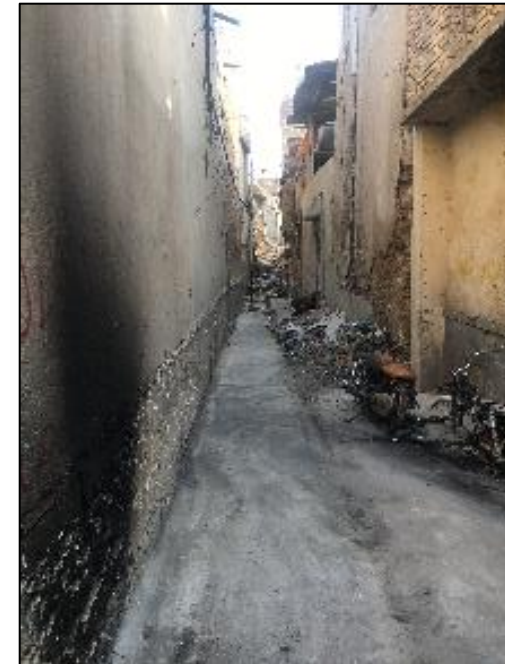
After rubble removal