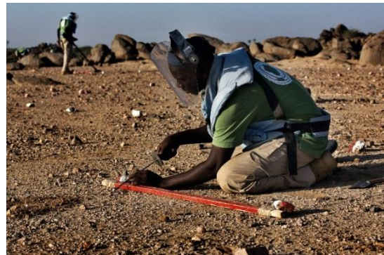
A deminer is carefully probing the ground

Since 2005, UNMAS has mobilized its efforts and resources to help fast recovery of the conflict-ridden Eastern states through survey and clearance. To date, UNMAS supported clearance of 777,132 sqm in Gedaref and 12,783,985 sqm in Red Sea leading to the announcements of Gedaref and Red Sea states free of known landmines in 2016 and 2017 respectively. In Kassala, UNMAS cleared 43,340,468 sqm of contaminated land already, and expects to clear all the remaining hazards by the end of 2017, aiming to announce the entire Eastern Sudan free of known landmine