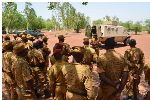
Certified trainers from Burkina Faso delivering training on IED threat mitigation measures.

The project designed an innovative approach to build the capacity of TCCs' infantry troops by conducting most of the specialized training in their home countries before deployment in order to minimize the training requirements once in Mali. This was achieved through the design and delivery of a comprehensive training package in IED threat mitigation tailored to the TCC's needs as well as through the provision of specialized equipment, hands-on training and mentoring of the troops once deployed in Mali. Furthermore, sustainability of the action is enhanced by providing training of national trainers on the IED awareness course.