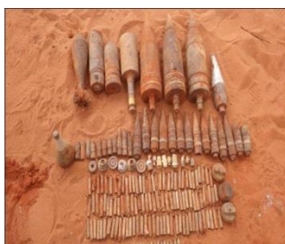
Excavated explosive hazards ready

During focussed group discussions in September 2017 with the local population, the latter reported a change in attitude once the demining has been completed.