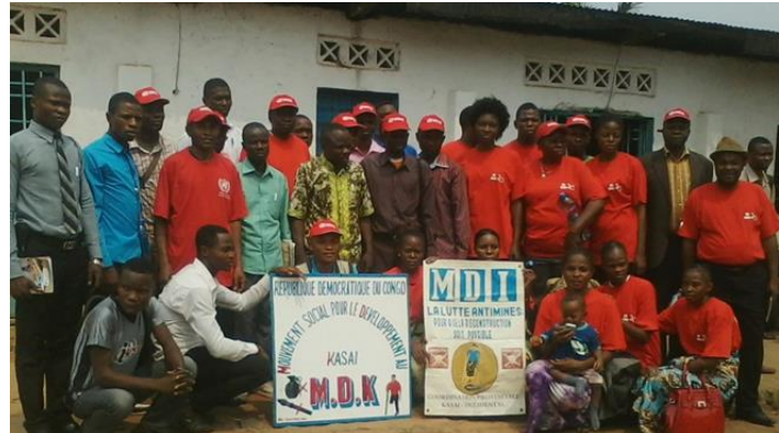
Staff members of MDK and MDI after receiving the risk education training delivered by UNMAS/CCLAM

Because the majority of Explosive Remnants of war (ERW) victims are children (82% since 2015), UNICEF requested UNMAS and the National Mine Action Center’s (CCLAM) support in conducting an assessment of the suspected contaminated schools and raise awareness on the dangers posed by mines/ERW before the beginning of the school year through mine risk education trainings.