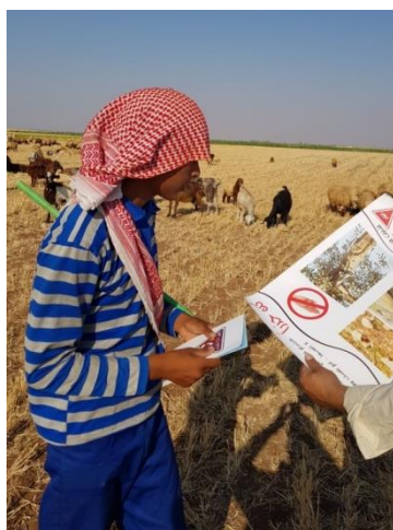
Shepherd receiving UNMAS risk education material in Idleb

With limited access for clearance of explosive hazards and ongoing fighting across the country, these hazards will continue to threaten the lives of men, women, and boys and girls on a daily basis. In this context, risk education delivered through informative, country specific material and awareness sessions by UNMAS Syria Response and the humanitarian partners under its coordination, contribute to making communities safer.