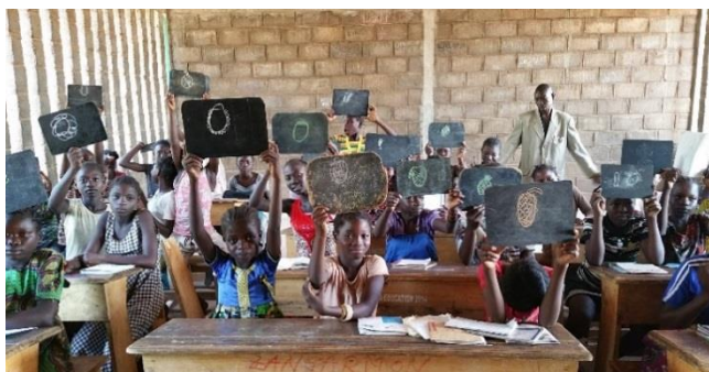
Risk education session in Assana school - Bangui

Across the country, UNMAS, through its implementing partner, deploys teams to engage with communities on the issue of contamination of ERW and SALW while implementing learning activities around the theme of risk education. Mine action partners conduct focus groups discussions and interviews with individuals at risk who have witnessed the conflict. An impact assessment has proven that beneficiaries' knowledge of ERW and SALW have improved and retained for a long period after benefitting from awareness sessions. The completion of Knowledge, Attitude and Practices surveys have demonstrated that the knowledge of beneficiaries receiving risk education has increased from 53% to 92% on the risks posed by ERW/SALW. Such proves a positive change in behaviour within beneficiary communities who can encounter hazards.