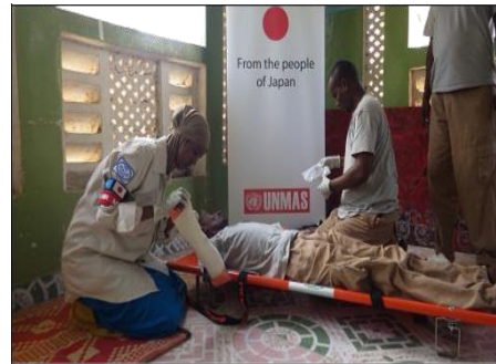
Woman attending medic training to support deminers

Striving to improve food security and diversify livelihoods options for the local communities in Qooqane in Southern Somalia, UNMAS cleared and released land, which was subsequently used for irrigation for inlands farms. In addition, UNMAS trained community members in Basic Life Support Skills, providing long-term skills for men and women working as medics to treat major trauma injuries from minefield accidents or other common ailments.