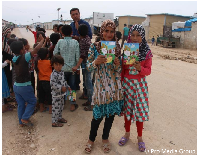
Girls with UNMAS risk education materials in an IDP camp near

Risk education (RE) is one of the five pillars of humanitarian mine action. RE is a life-saving activity that helps mitigate the risks and raises awareness of the threat of explosive hazards and provides people with the necessary knowledge to stay out of harm's way. Due to the shifting frontlines of the Syrian conflict, 8.2 million people are now living in communities reporting explosive hazard contamination, a significant increase from 6.3 million in 2016. UNMAS contributed to UNFPA-led focus group discussions aimed at determining the impact of protection interventions, including the mitigation of explosive hazards risks. The focus groups revealed a positive behavioural change in the presence of explosive hazards for people and communities that had received RE, in comparison to the communities that had not received any form of RE/risk awareness. This demonstrates the clear impact of mine action interventions to promote safe behaviour among communities at risk and prevent casualties from explosives hazards.