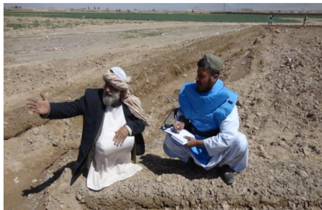
Deminer and Jelawur resident discuss the positive impact of demining on this community

The following snapshots from a 2016/17 (1395) project made possible with a contribution from Japan, illustrates just how important the clearance of landmines and explosive remnants of war (ERW) is for the communities affected by contamination. 1