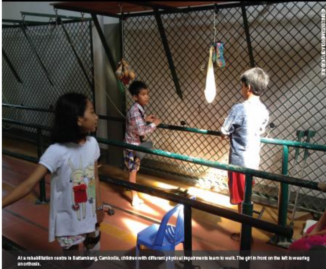
At a rehabilitation centre in Battambang, Cambodia, children with different physical impairments learn to walk. The girl in front on the left is wearing an orthosis.