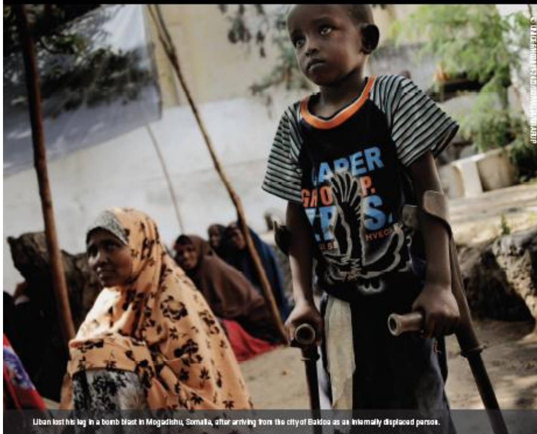
Uban lost his leg in a bomb blast in Mogadishu, Somalia, after arriving from the city of Baldoa as an internally displaced person.