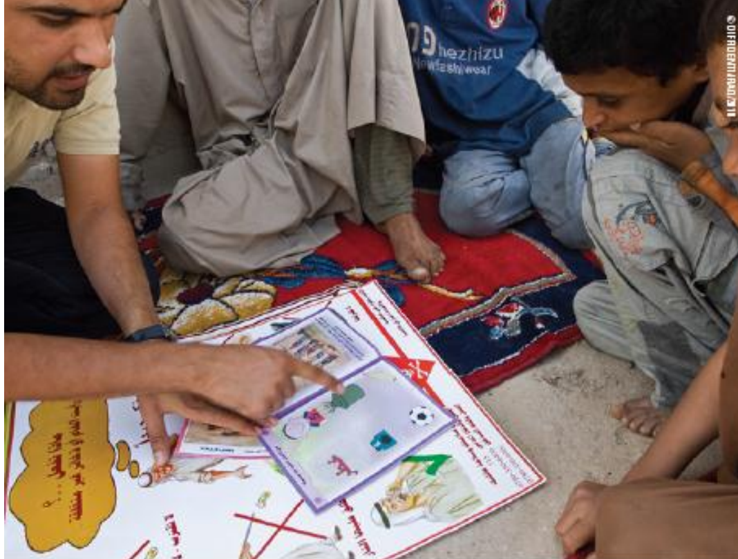
Boys learn about the dangers of mines and other Explosive Remnants of War during a mine risk education session in Basra, Iraq.