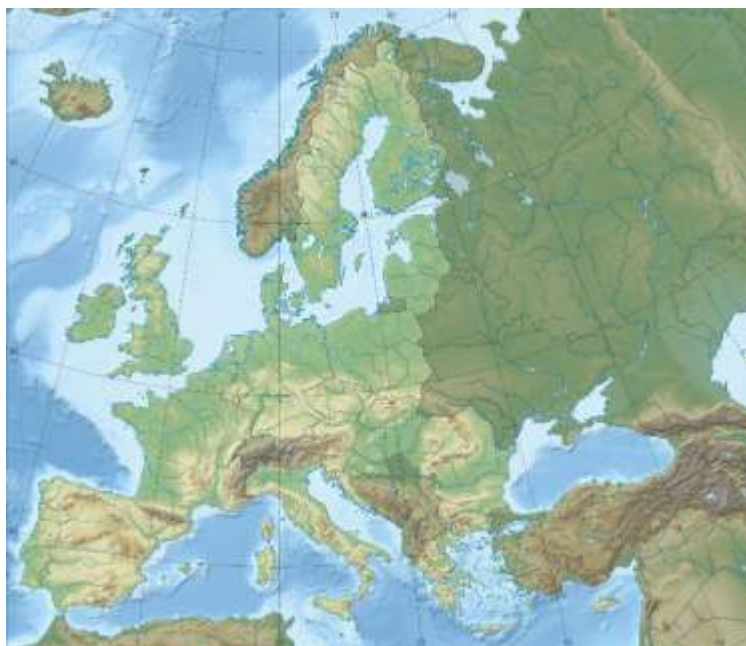
2) Regional level