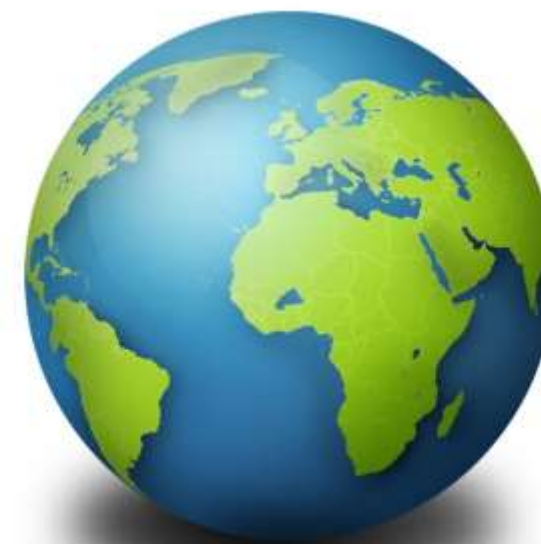
3) Multilateral level