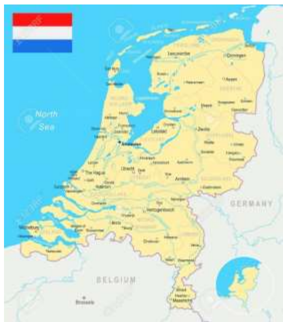
1) National level